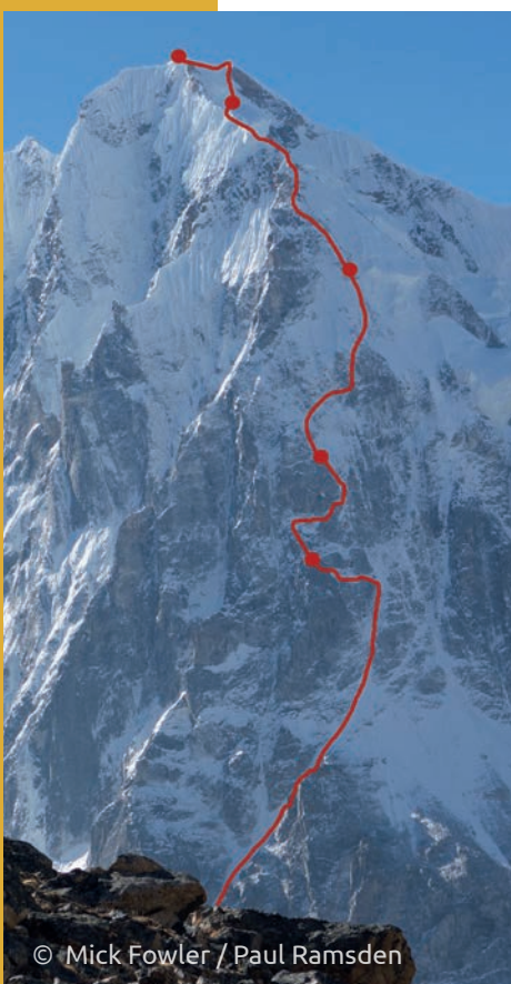
© Mick Fowler / Paul Ramsden

The tenacious team of Paul Ramsden and Mick Fowler, who already received a Piolet d'Or in 2002 for their ascent of Siguniang and another in 2013 for the Prow of Shiva, made the first ascent of this isolated summit on the northwest border of Nepal. After studying different possibilities, the English climbers spent five days (from base camp to summit) putting up a very elegant new line on the north face. The route is protected from objective dangers. They reached the summit on 22 October and made the descent in two days by the west ridge and then a couloir on the north side. The overall difficulty of the 1,600 m route is estimated at ED+. Paul's description of the line: " The first half is similar to the north face of the Eiger in terms of the complexity of the itinerary, the second half is similar to the Peuterey ridge. "